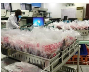
Blood Bank Center